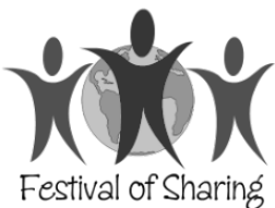
Festival of Sharing

Back Snack will begin its fifth year of serving the Hickman Mills school district and your help is needed. If you have an hour to an hour and a half to give once a month to help bag the packs of food provided by Harvesters to feed children on the weekends, sign-up to help at the Welcome Center. Truman Elementary is our partner school and we have been packing food bags for 100 kids each week.